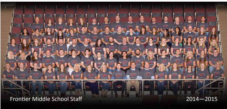
Frontier Middle School Staff

Enlightening the mind, unlocking the future.