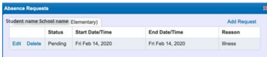
Figure 4. Absence Request Screen

Note: There is still an option to edit the absence request or delete it after it has been submitted (see Figure 4). Click on 'Edit' or 'Delete' to make any modifications.