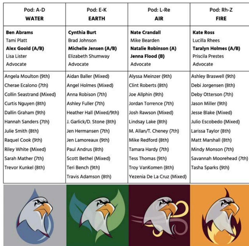
Pod Assignments 2024-2025

purpose of our Homeroom Pods is to help students feel an even greater connection to one another through Homeroom, to help admin, counselors, and coaches participate in Homeroom and provide even deeper support to the students in the portion of the alphabet already assigned to them, and to help our teachers grow in their capacity to lead Homeroom. Some of the homeroom classes are grade level specific, and some of them have students from mixed grades. All of these changes are based on feedback received from students, parents, and teachers on how we can improve the Homeroom experience.. Truly, we want Homeroom to matter and to be helpful to all. I am excited to update you as the year progresses on the awesome things our students are up to in their Homeroom classes and pods!